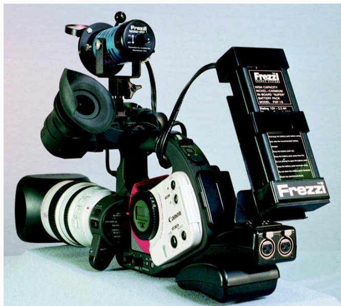
MFKIC-XL1 Light Kit shown with optional Soft Box (Canon MA-100 shoulder pad accessory required)

Belts or waist packs are no longer needed to power a Frezzi Mini-Fill, Dimmer Mini-Fill, or Mini-Sun Gun on the popular Canon XL-1 camera. By utilizing the Canon MA-100 shoulder pad accessory and the Frezzi NP1-CB camera bracket, a separate battery for powering your light may be attached directly to the back of the camera. Frezzi's reliable FNP-1S battery will power a Mini-Fill with a 50 watt bulb for over 30 minutes, a 35 watt bulb for over 45 minutes, and a 20 watt bulb for over 75 minutes.