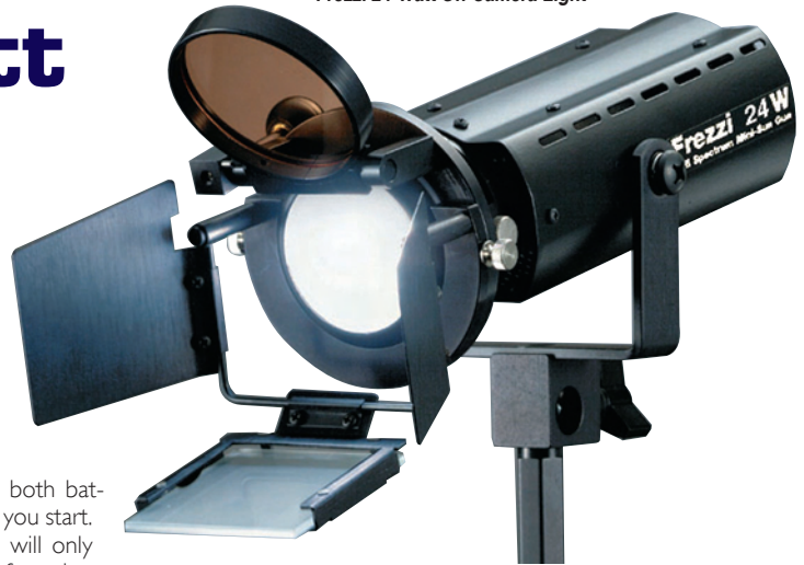
Frezzi 24-Watt On-Camera Light

blended perfectly with the daylight coming in the windows without casting any harsh shadows on the wall behind them. With daylight from the windows acting as a backlight, the one-light setup was quick and effective. There were many other situations like this, and the Frezzi 200 HMI quickly became my light of choice on this shoot.