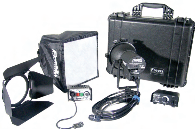
Frezzi SSGK1-200AC/DC kit